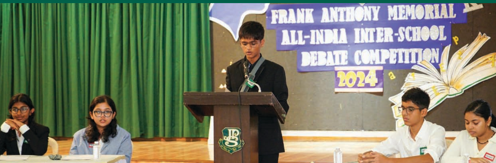
Frank Anthony memorial debate competition being hosted in JPS