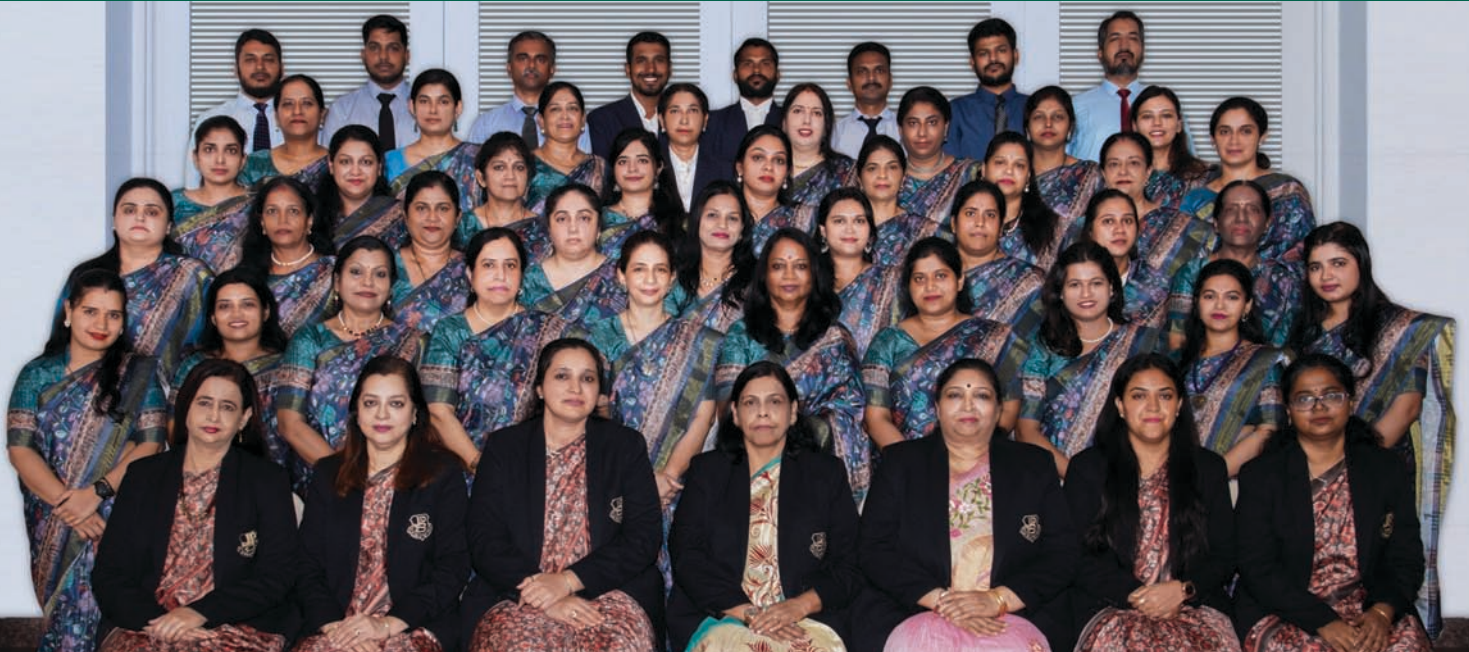
Our Strength - Staff of Pre-Primary, Primary, Secondary & Higher Secondary Sections