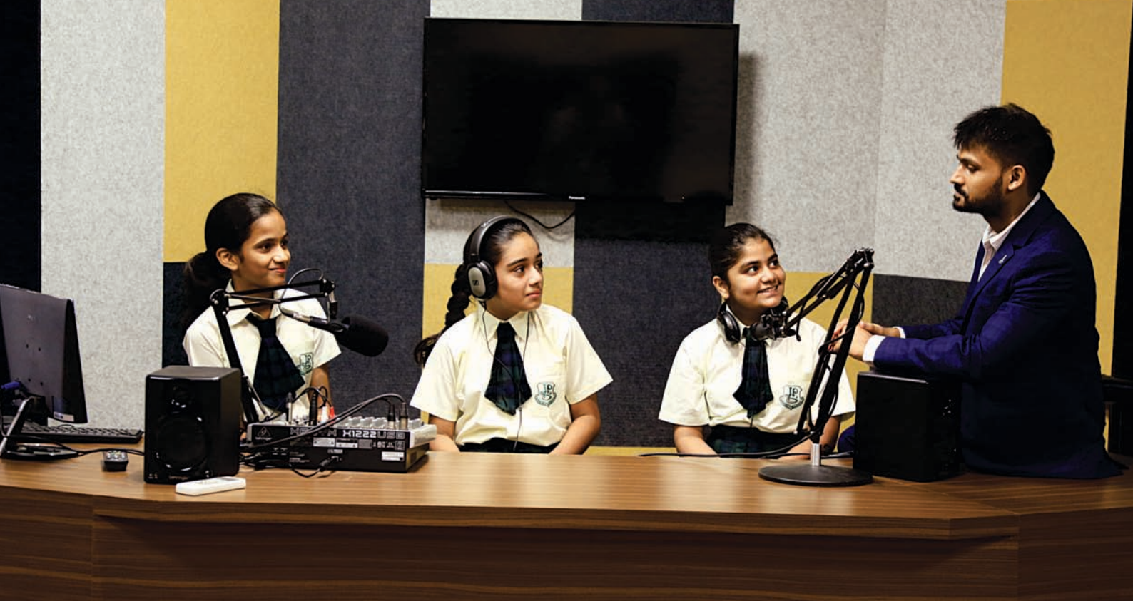
'JPS We Kids Radio' gets worldwide recognition, featured in an international documentary listed by UNESCO archived by National Film Archive of India (Government of India).