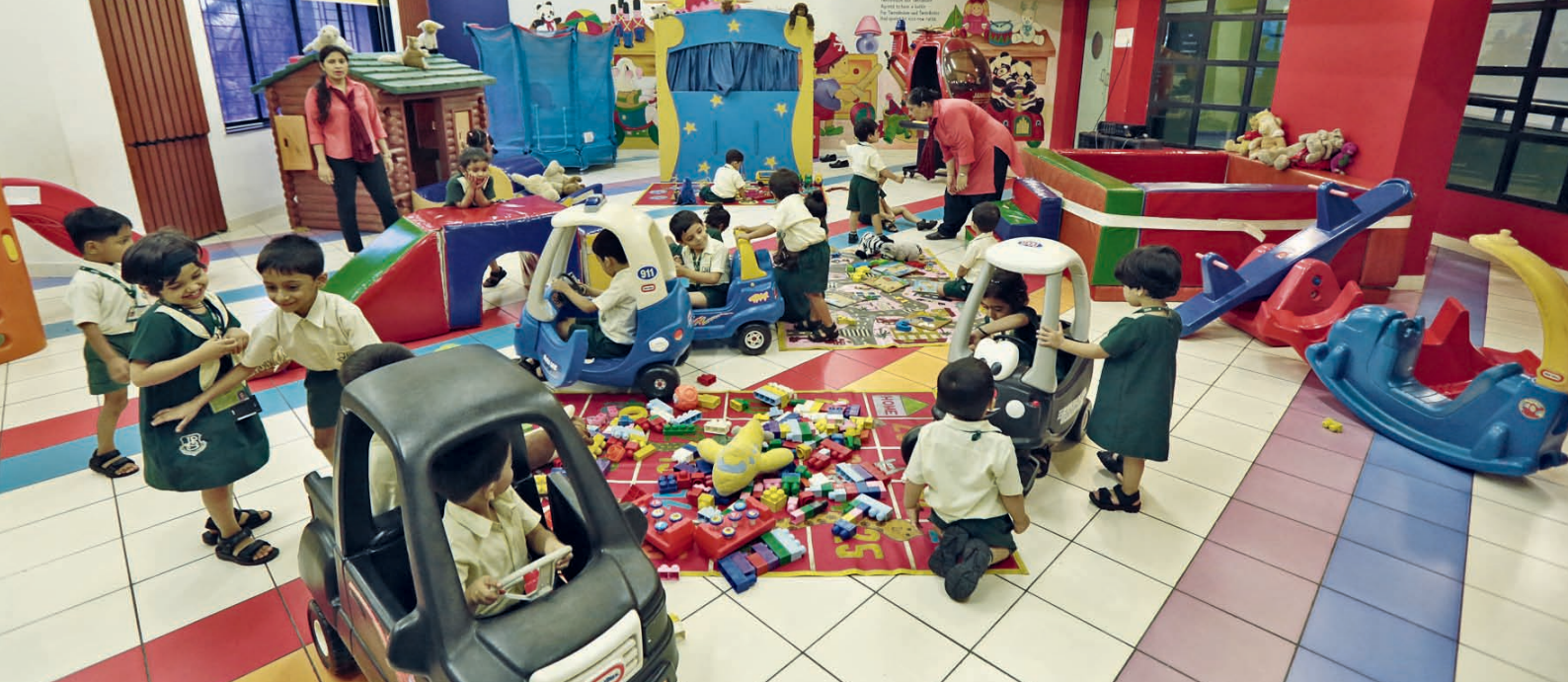
The First Step to Education