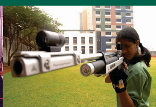
Rifle shooting session