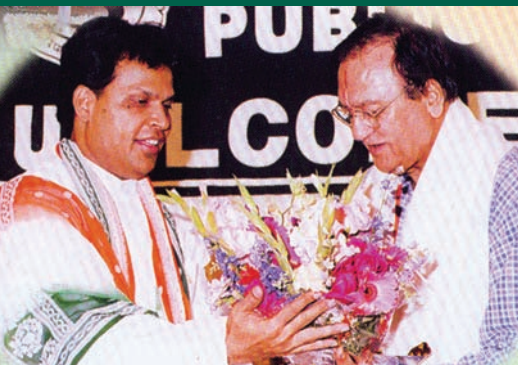
Late MP Shri Sunil Dutt visited JPS