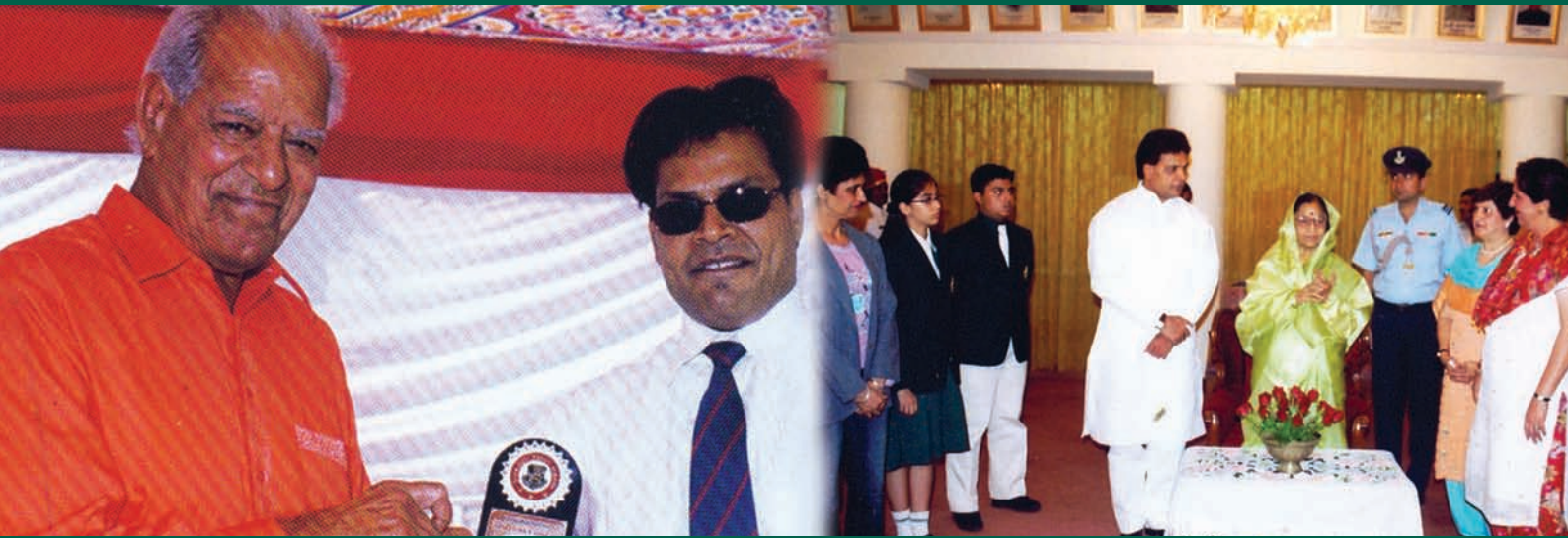
Shri Dara Singh was the guest of Honour on Sports Day