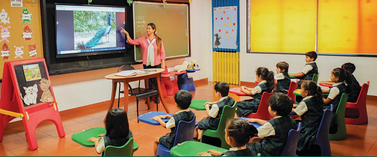
Learning is Fun