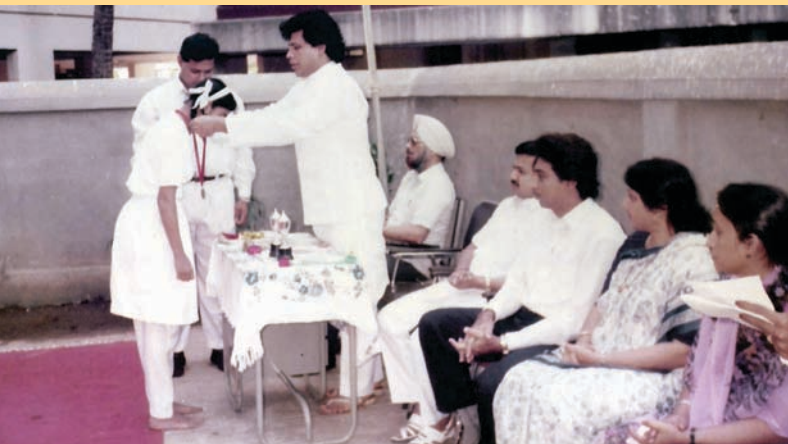
Children being awarded by Chairman