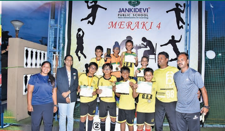
Meraki interschool sports competition