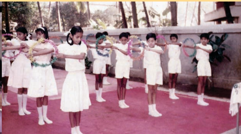
Holistic development of mind, body and soul