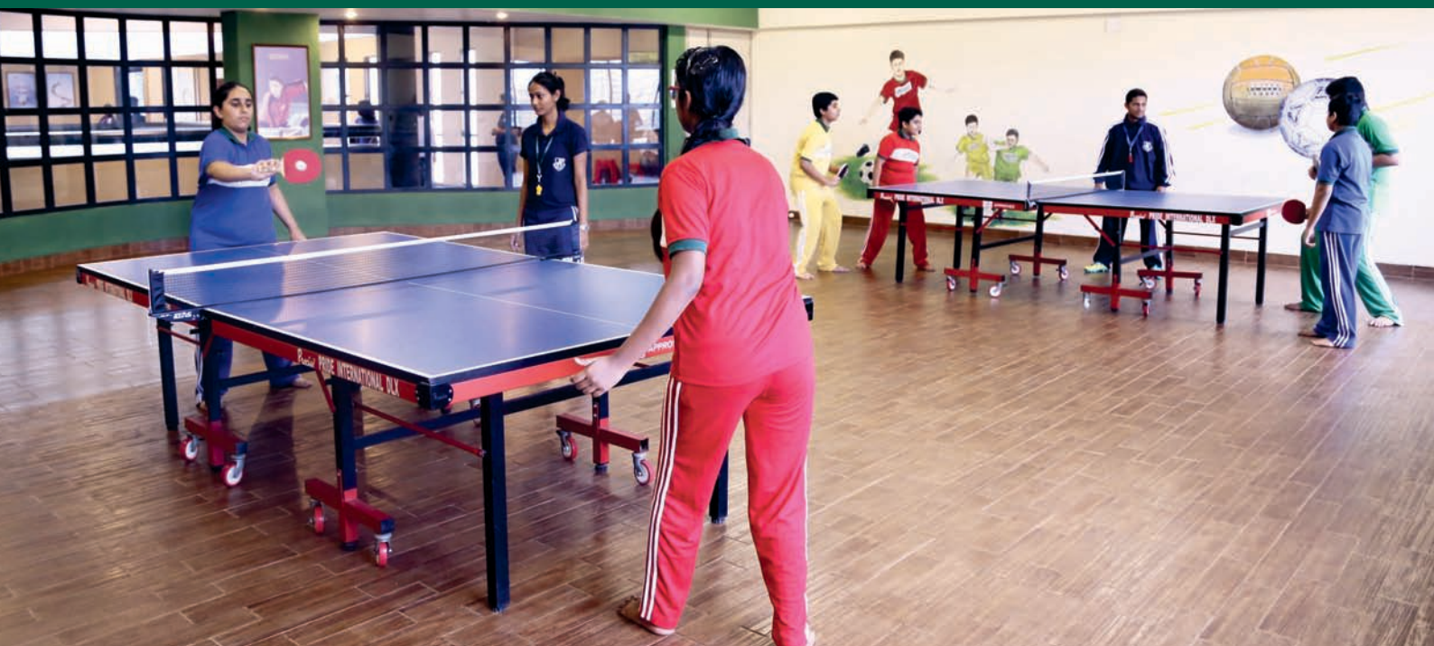
Martial Arts, Table Tennis Room